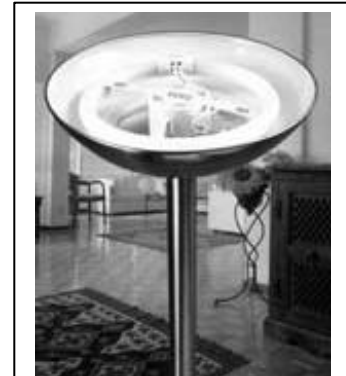
Compact fluorescent torchiere floor lamps are safer than halogens and use a fraction of the energy.