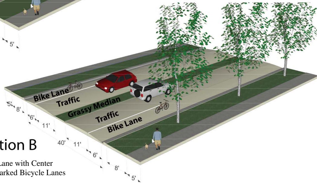
Two-Driving Lane with Center Median and Marked Bicycle Lanes