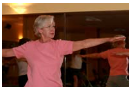
Yoga, Pilates, Tai Chi

Several months ago, SAIL contacted Harbor to explore membership opportunities because of Harbor’s stellar reputation in the community and their comprehensive approach to improving one’s health - mind, body, and spirit. We like the fact that several classes are geared toward older adults. These classes include Gentle Joints, Joints in Motion,