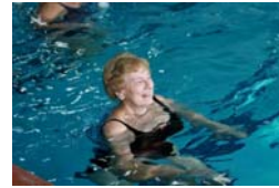
Warm Water Pool

Harbor Athletic is a full service health club located at 2529 Allen Blvd. in Middleton. A twenty-one year recipient of the Best of Madison Awards, Harbor has expanded steadily to include a warm water exercise pool and a state of the art wellness center. This is a “spandex not required” atmosphere, where members of all ages feel welcome and at home.